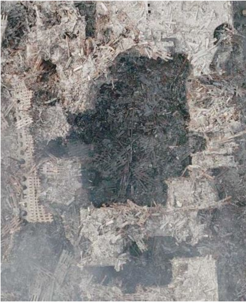
Figure 2. This image is taken from Figure 63 on DrJudyWood.com – World Trade Center aerial view shortly after 9-11. The round laser holes are obvious – they look like cookie-cutter holes. Perps are not allowed to know about this, because they will realize their FBI bosses are criminals.

drjudywood.com/articles/DEW/StarWarsBeam4.html