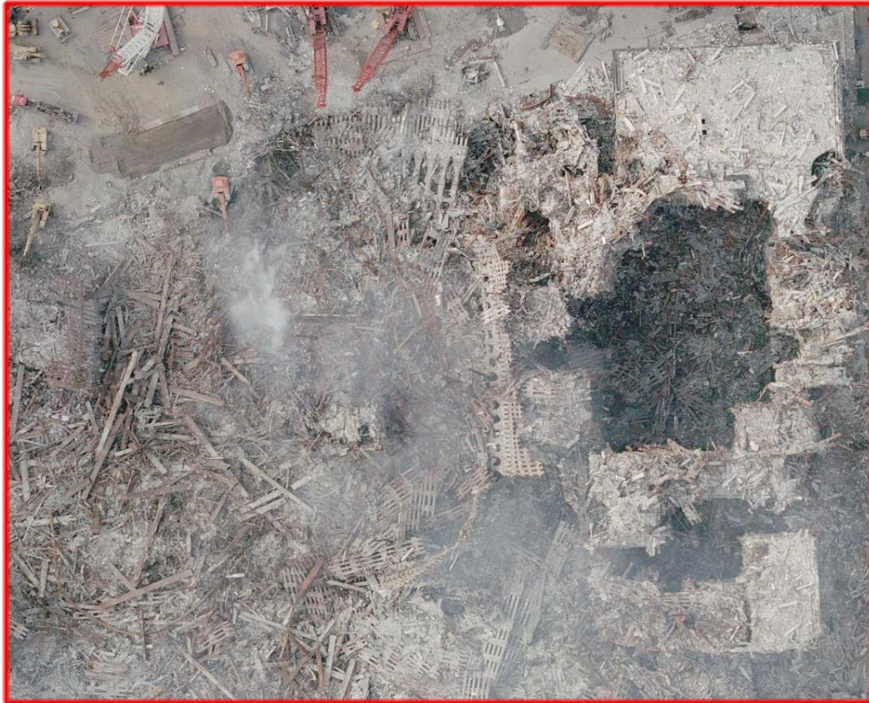
Figure 2. Aerial view of WTC on the afternoon of 9-11. Note the rounded-arc pattern in the holes.