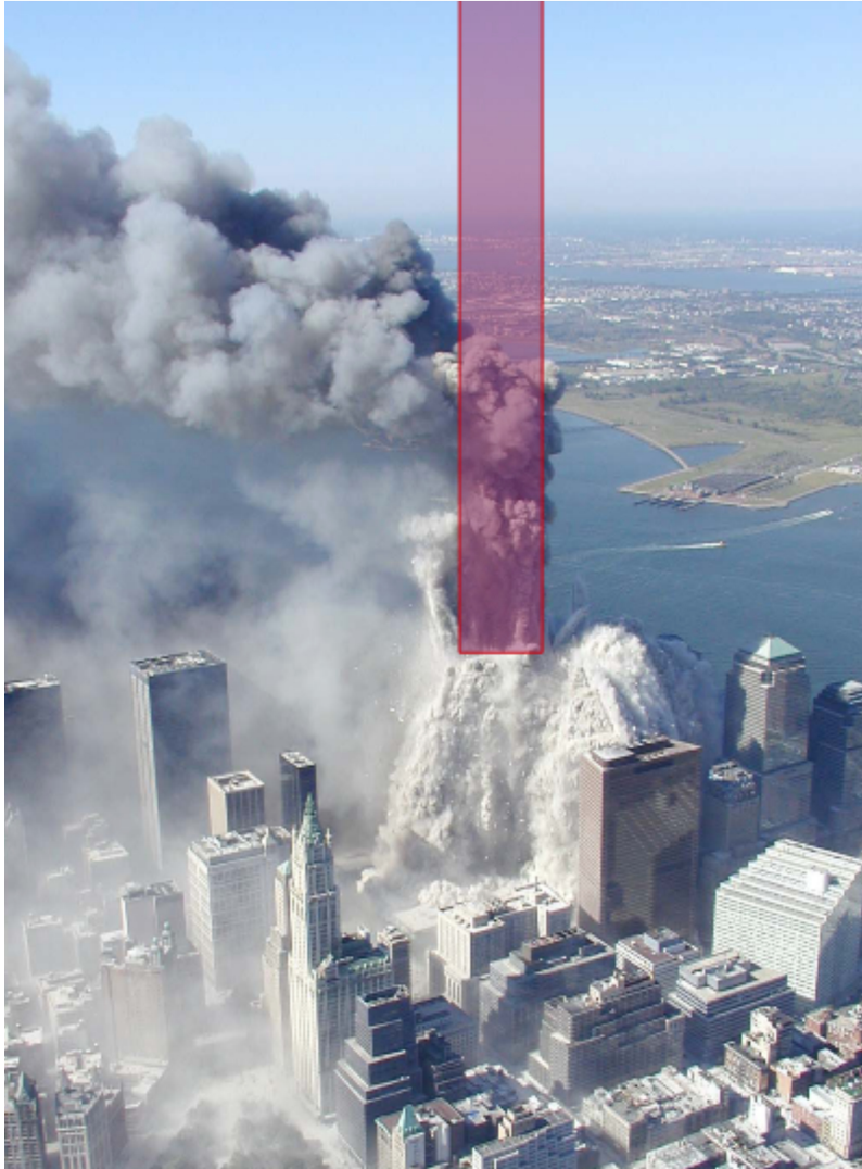
Fig. 1. If your eyes could see into the infrared light spectrum, it would have looked something like this.

the World Trade Center on the afternoon of 9-11. This new type of Infra-Red Laser is as different from conventional lasers, as a nuclear bomb is different from a conventional bomb. It is far more powerful. It was able to reduce the World Trade Center into fine dust, in less than 8 seconds. That's one million tons of concrete and steel, gone in 8 seconds.