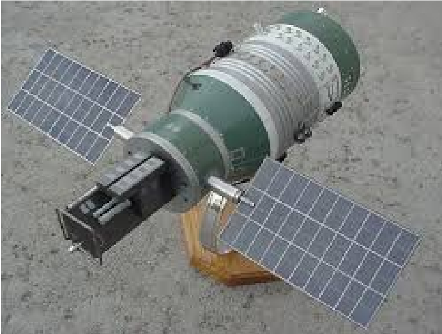
Figure 4. This design is similar to the Infra-Red Laser Satellite used in orbit. Do not underestimate the power of this laser by its size. Compare the difference between a nuclear bomb and a conventional bomb - that's the difference in power for this new type of laser. It was able to reduce the WTC buildings to fine dust in less that 8 seconds. That's more than one million tons of concrete and steel, gone in 8 seconds.

Figure 3. Larger aerial view of WTC – note holes penetrating the building in the lower right – obscured by dust.