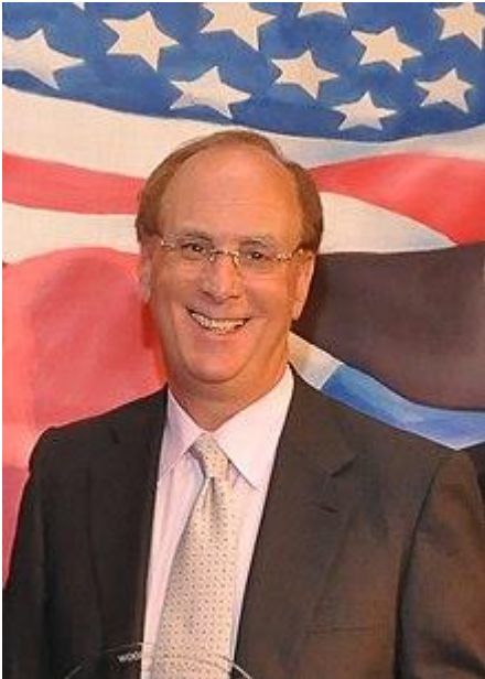
Laurence Douglas Fink, 66